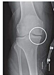
Knee OA with bracing (space created between bones)

When deciding on what knee brace is right for your condition it is important to be assessed by a certified professional. Braces fit everyone differently and what works for some might not work for others. Knee history, symptoms, and level of activities are all variables that influence the proper brace choice for a