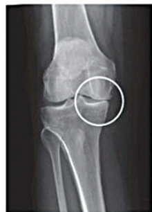
Knee OA without bracing (bone-on-bone contact)

Tri-compartment OA refers to having arthritis in all three joint spaces. When this is the case a stabilization brace with hinges and/or compression to control swelling would be the more appropriate brace. By stabilizing the knee joint it prevents rubbing or friction in the joint spaces while also tracking the patella.